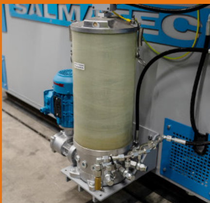
Piston pump GMF with ATEX motor