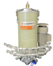
GMF-F Piston pump