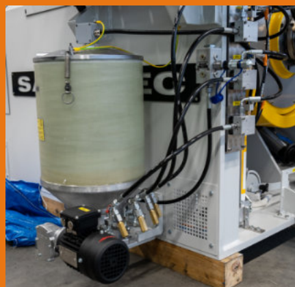
Piston pump GMF with pressure relief valves and distributors, designed for safe, efficient pellet press lubrication, with easy refilling and integrated filtration.