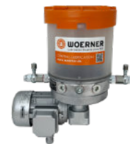
GMA-C Piston pump