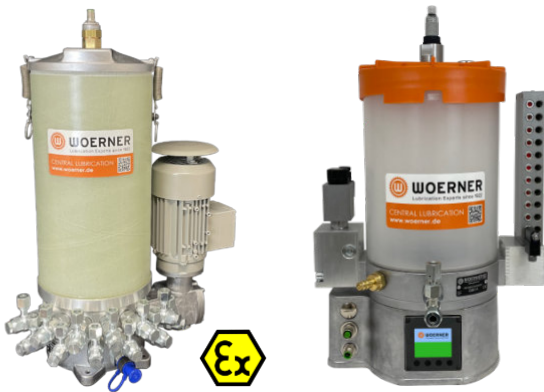
Piston pump GMF-F and GMO-A