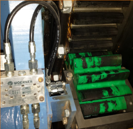
Progressive distributor serving a lubrication gearwheel