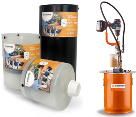
Cartridge system Kx and filling pump Power Fill Pro