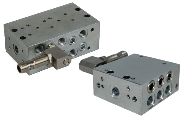
Progressive distributors VPB-VS / VPB-VN and VPB-SSV